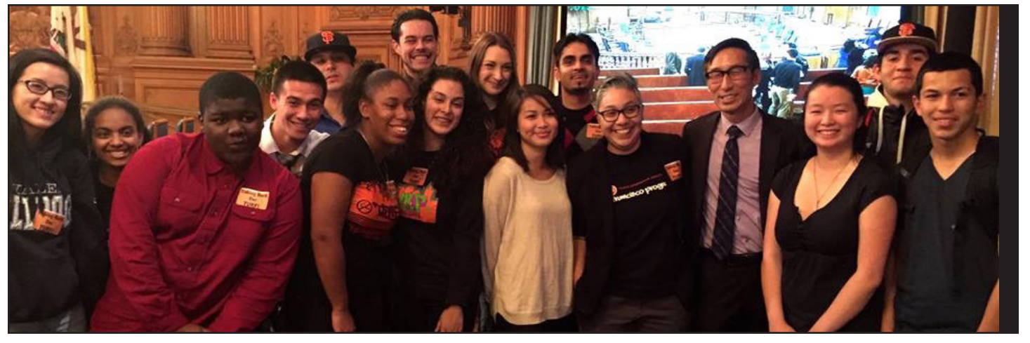
Advocates of the Tobacco Use Reduction Force (TURF) of the Youth Leadership Institute (YLI).

To address this, and educate retailers about the new policy, the Environmental Health Branch and the Tobacco-Free Project began a broad outreach effort. Staff sent retailers letters about the law and gave presentations before the Small Business Commission and the Board of Appeals. The Environmental Health Branch also periodically conducted in-person compliance check visits to tobacco stores, which gave staff an opportunity to educate retailers about the law and to explain how the law would impact them in the event of a change of ownership.